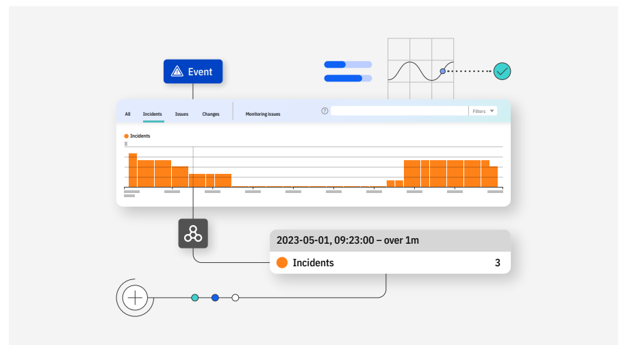
Figure 1: Using automated incident remediation, Instana helps teams to catch issues before they impact customers.

The IBM Instana® Observability platform provides automated observability powered by AI. With real-time change detection, the platform automatically and continuously discovers and contextualizes the most dynamic and complex applications. It empowers application stakeholders with accurate and contextual high-fidelity data, helping them quickly detect and resolve issues while recommending intelligent actions to improve application performance.